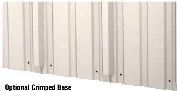
Optional Crimped Base